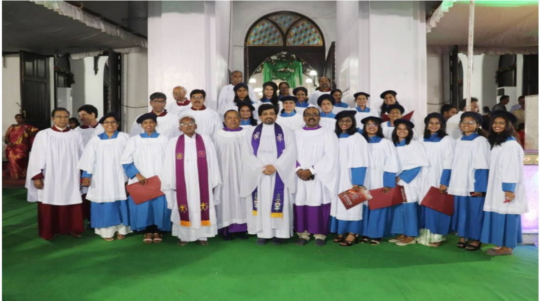
Church of St John the Baptist, Secunderabad voice Choristers