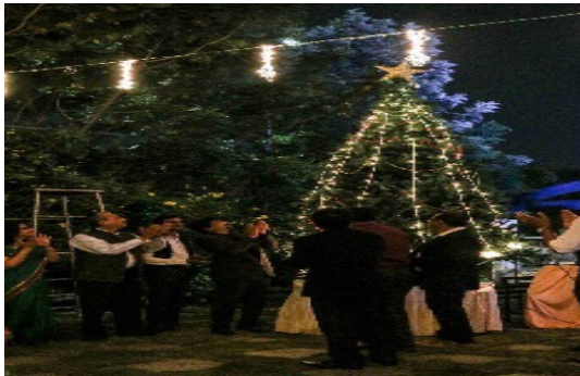
Christmas Tree 2019 launching by the Pastorate Committee and the Pastor