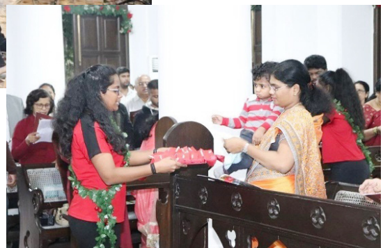
Few glimpses during the programme...Candles, procession and distribution