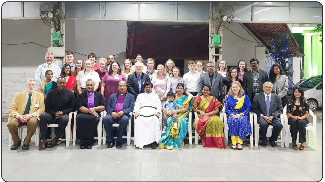
Guests from US visited the Church of St John the Baptist, Secunderabad during the Watchnight Service [31/12/19]. The message was delivered by The Bishop LaTrelle Miller Easterling (United Methodist Church, USA).