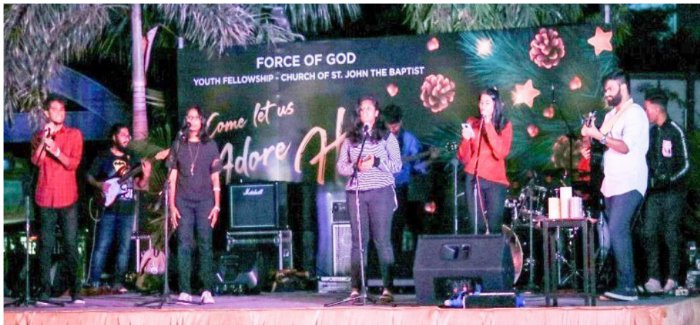
The FOG team in full-swing