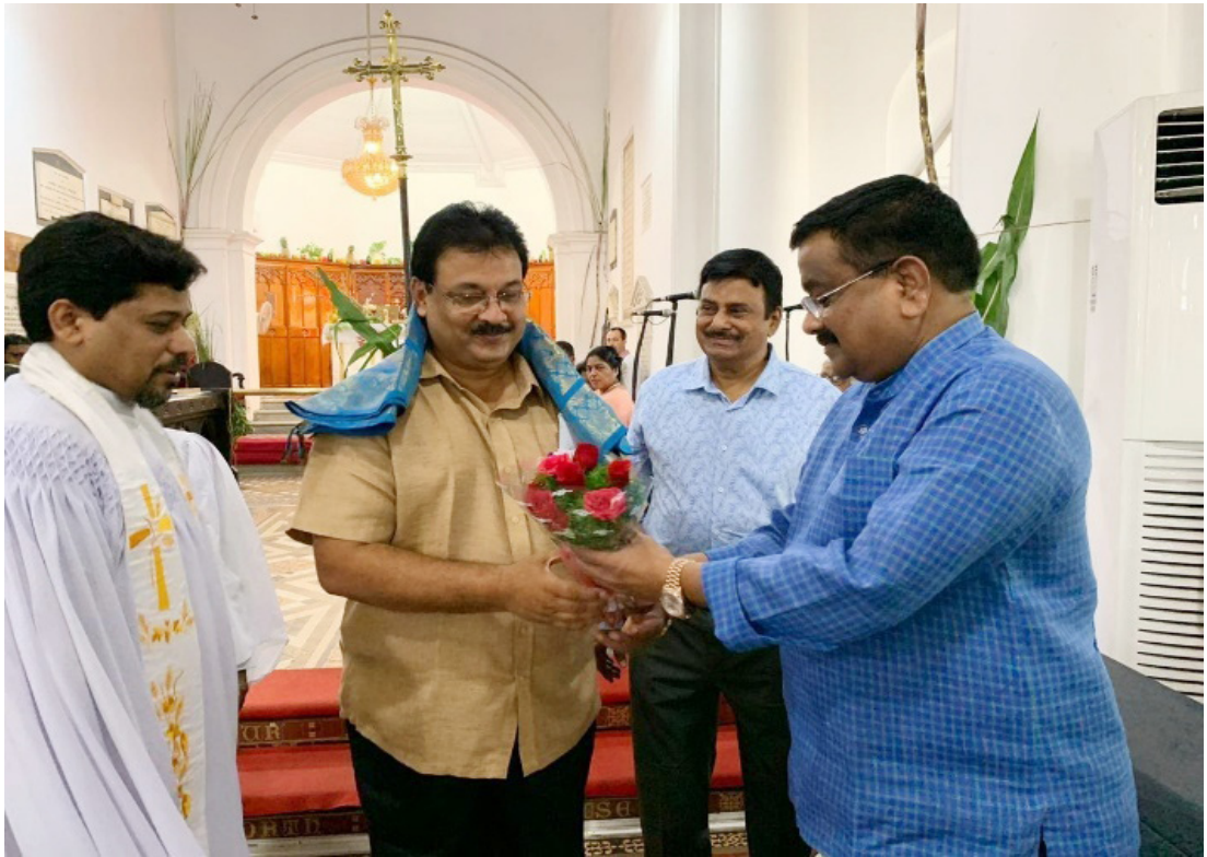
Honouring our Pastorate Treasurer on being elected as World Cup Basketball Commissioner and Technical Delegate from India