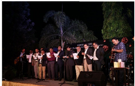
The Christmas Tree programme by the Men of Church of St John the Baptist