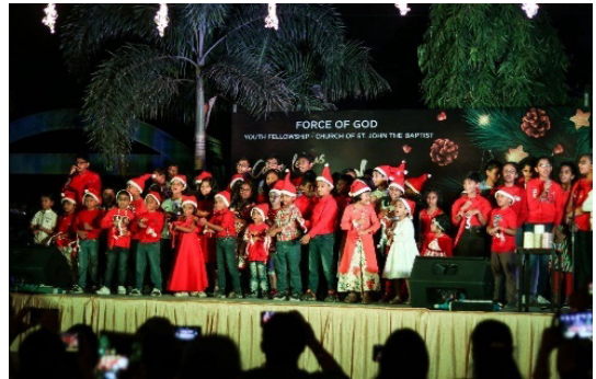
Little Red Riding Hoods on their way singing Jingle bells, jingle bells. Jingle all the way....