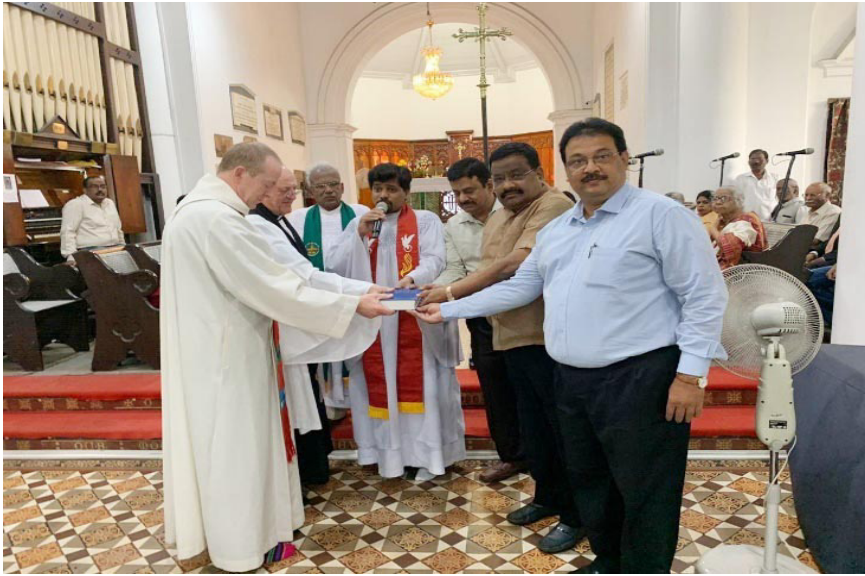
Officers of the Pastorate receiving a copy of the Hymn Book from the Vicars of Church of England on 24th November, 2019