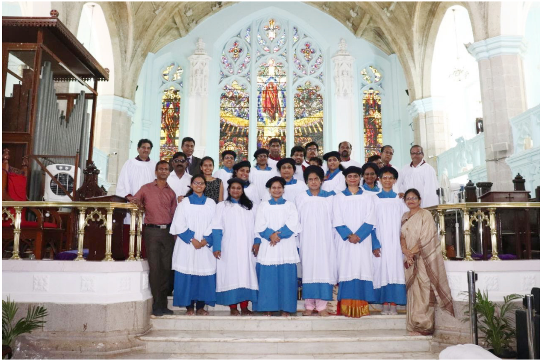
Our choir rendered special numbers during the visit of Archbishop of Canterbury - Justin Welby at Medak Cathedral Church (CSI) on Sept 5th, 2019