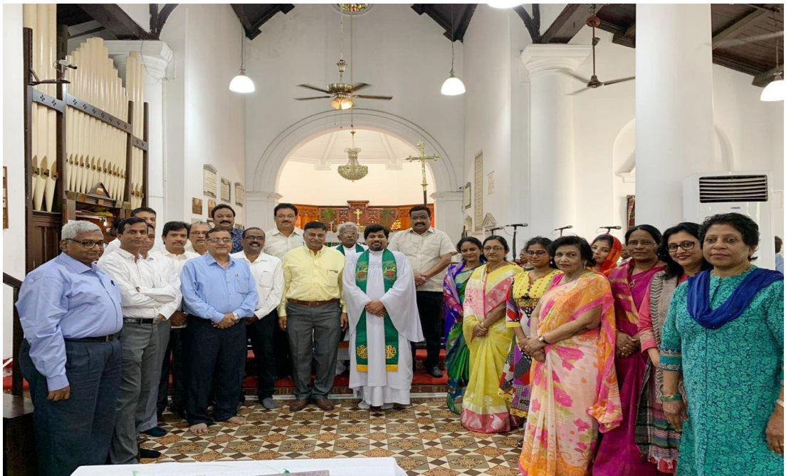
Welcome to the New Committee Members of the Pastorate along with the Sectional Secretaries