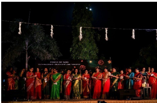
The vibrant Women's team all dressed in green and red singing 'While Shepherds watch their flocks by night.'